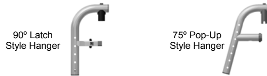
90° Latch Style Hanger