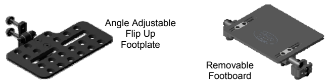
Angle Adjustable Flip Up Footplate