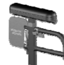
Height Adjustable Padded Armrest