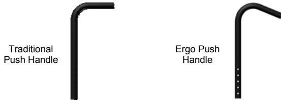
Traditional Push Handle