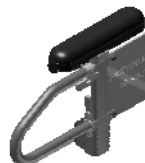
Height Adjustable Padded Armrest