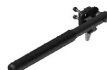
Locking Flip Back Armrest