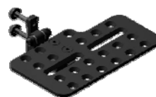
Angle Adjustable Flip Up Footplate