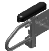
Height Adjustable Padded Armrest