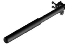
Flip Back Armrest