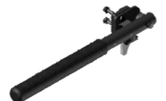
Locking Flip Back Armrest