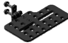
Flip Up Footplate